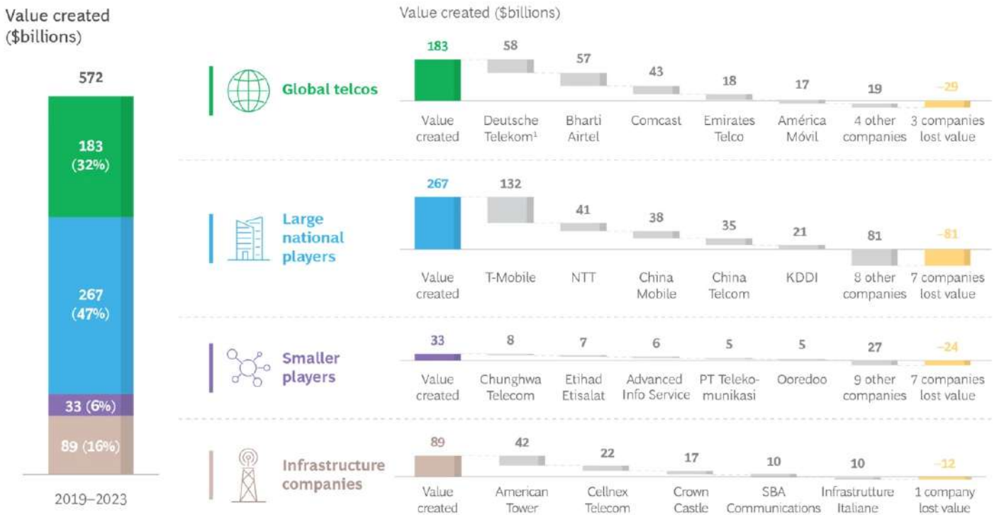
Exhibit 4 - Which Archetype Has Created the Most Value?