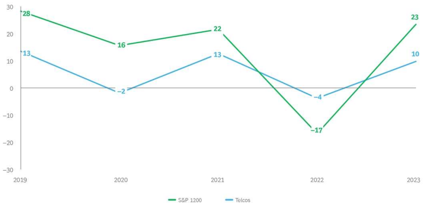
Annual median TSR (%)