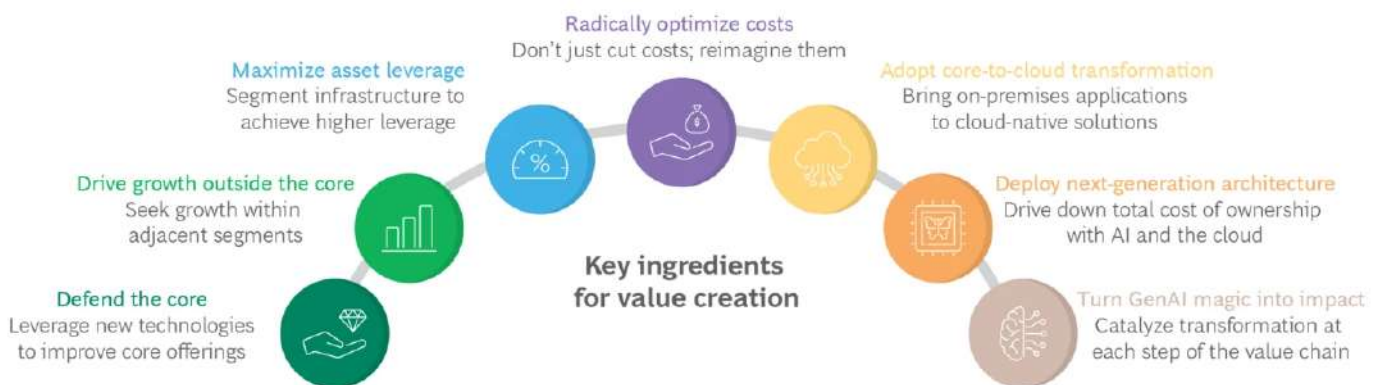
Exhibit 6 - The New Formula: Seven Ways to Create Value in 2024 and Beyond

The strategies discussed above show how innovative managers have generated value over the past five years. But new thinking will be needed for creating value over the next five years. In pursuing a formula for success, we have identified seven key ingredients that telcos must deploy to achieve optimal results. (See Exhibit 6.)